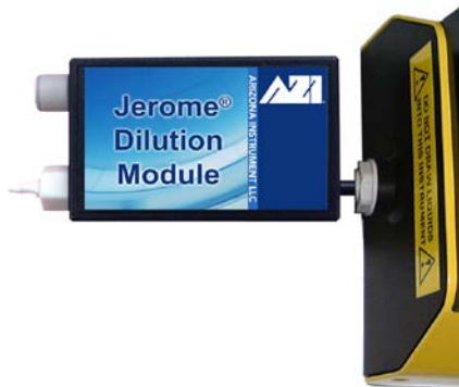
Figure 2 - J405 / J505 / J605 with Dilution Module