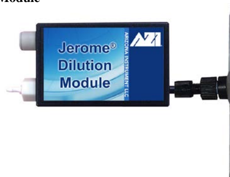
Figure 3 - 431-X / 631-X with Dilution Module